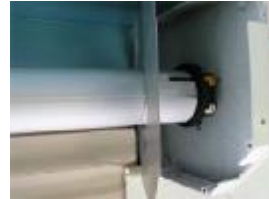
SOMFY electric motor on right side of roller shutter.

White button is to set the down limit, the yellow button is to set the upper limit. Yellow button is to set the down limit, the white button is to set the upper limit.