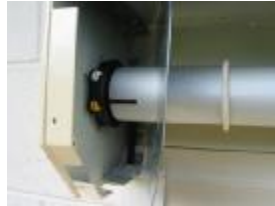
SOMFY electric motor on left side of roller shutter

At the motor end of the Roller Shutter you will see a Yellow and a White button. These are to set the stop position of the Roller Shutter at the fully open and fully closed position.